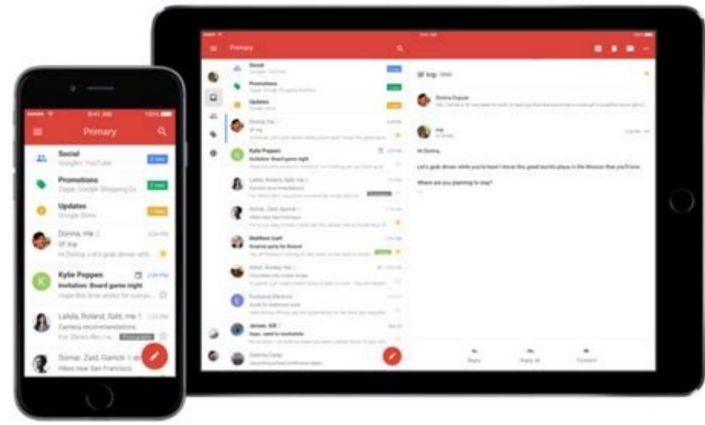
Text message app for android tablet. Best message app for android tablet. Best text message app for android tablet.