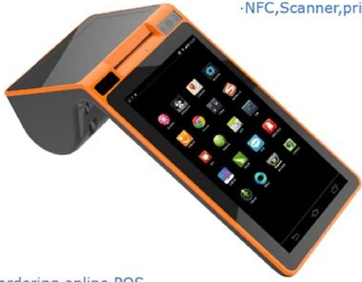
ordering online POS